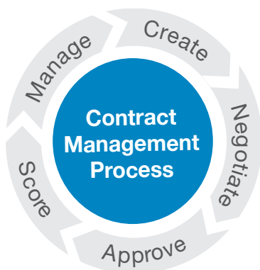
Typical Contract Process

Though almost everything has changed about how modern organizations execute and manage contracts, one thing remains the same: contracts are still the bedrock of all your business relationships and transactions.