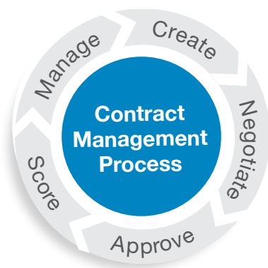
Typical Contract Process

Though almost everything has changed about how modern organizations execute and manage contracts, one thing remains the same: contracts are still the bedrock of all your business relationships and transactions.